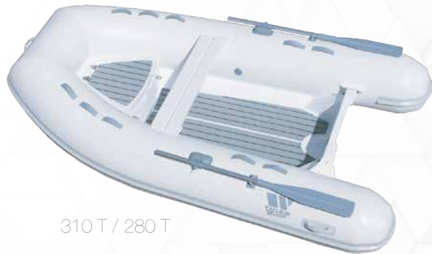
310 T / 280 T