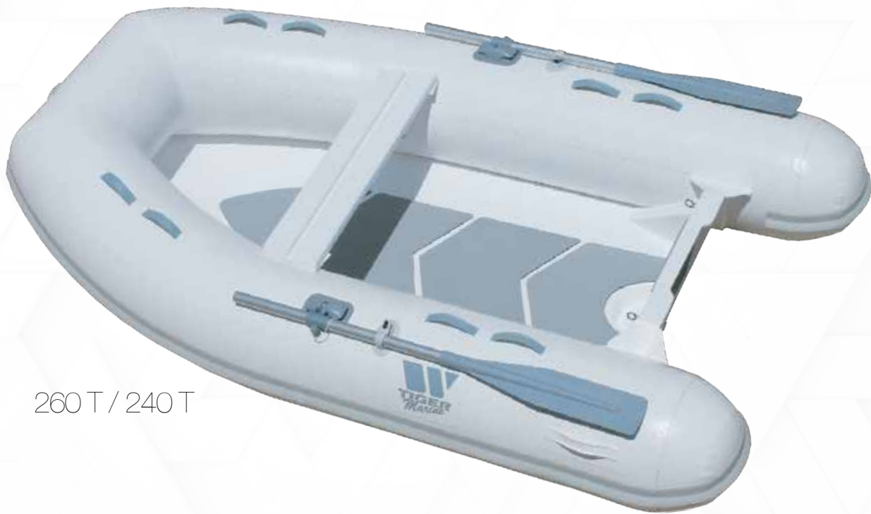
260 T / 240 T