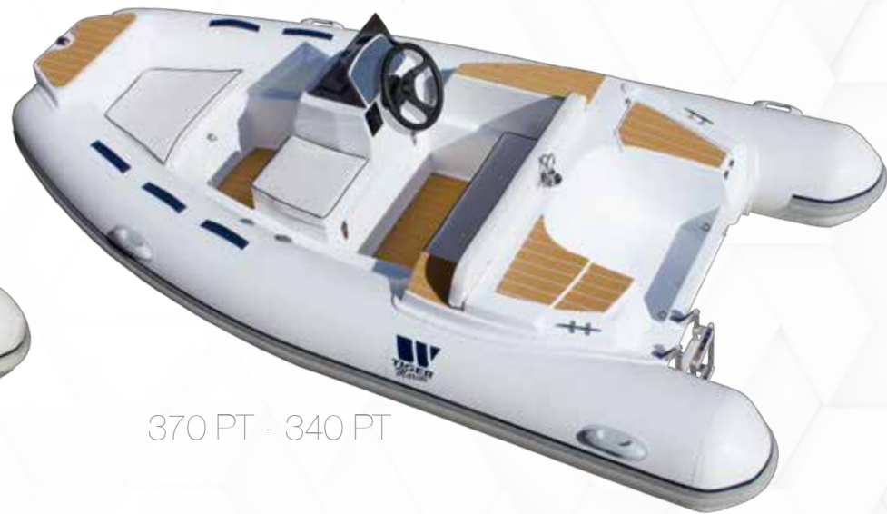
370 PT - 340 PT